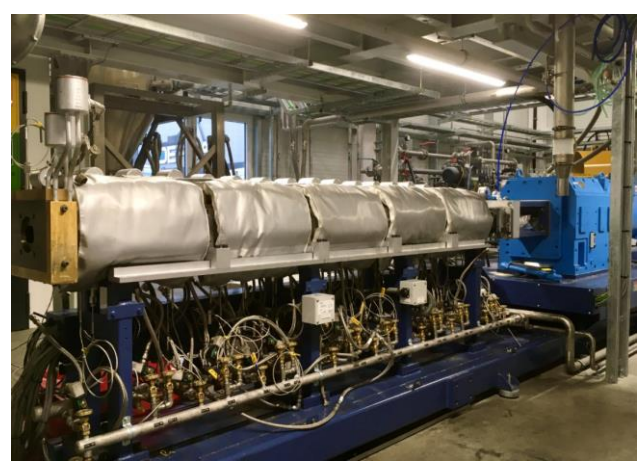
TEX44αIII: modified trial extruder for the depolymerization of end-of-life PMMA waste