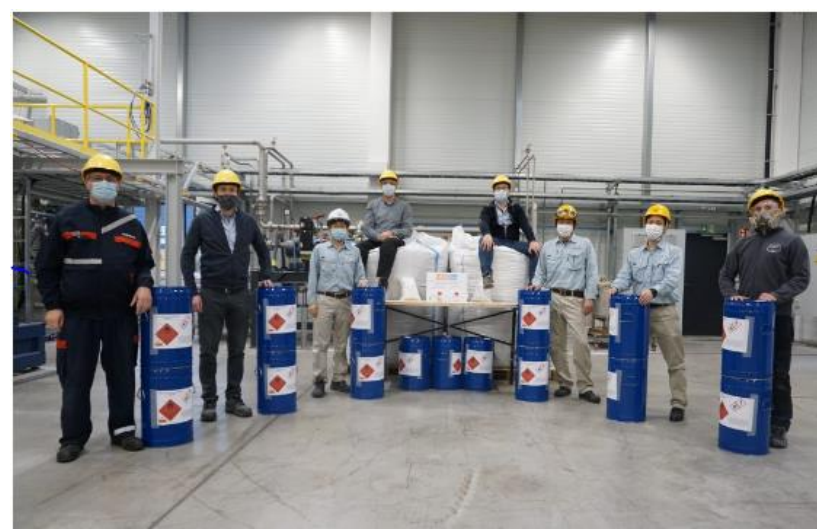
JSW's Extrusion Technical Center, Düsseldorf/Germany: successful test, November 2020