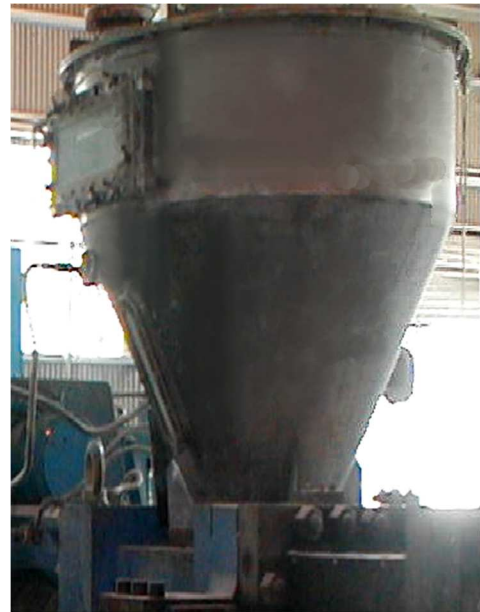
TEX + Compactor Test Equipment